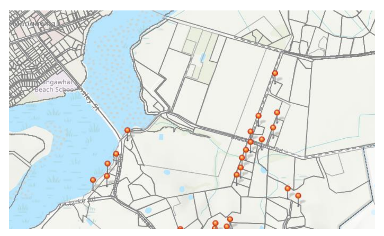
Figure 3: Sites Less than 1ha (red)

The surrounding area is dominated by rural-residential development of lifestyle lots between 1 and 5ha. There is no remaining rural production land. Sites less than 1ha are shown below in red in Figure 5 below. Lifestyle subdivision has been prolific in the last 10 years, however the majority of lots in the wider area are larger than 1ha. There is a commercial activity directly opposite the site, being a mechanic and boat workshop. Black Swamp Rd is a local road with varying speed limits that is maintained in gravel in this location.